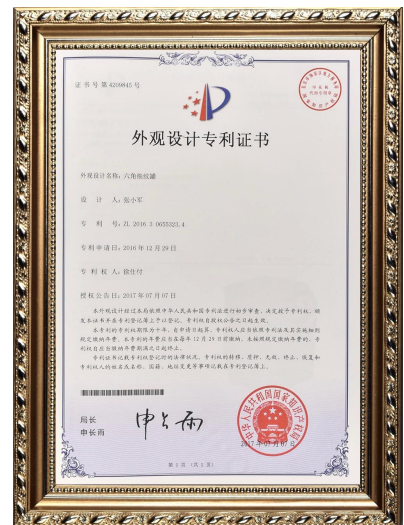
Patent n.: 201.630.655.323.4