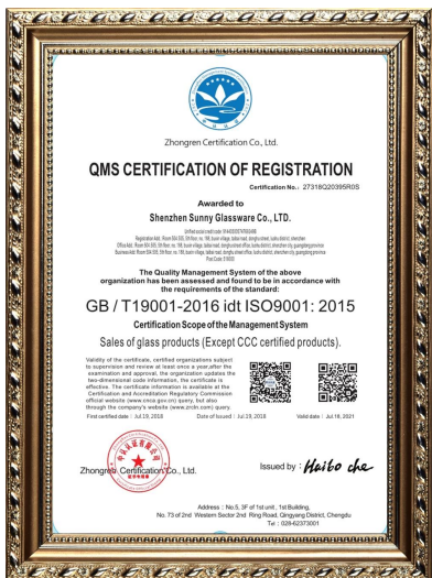
ISO 9001: 2015