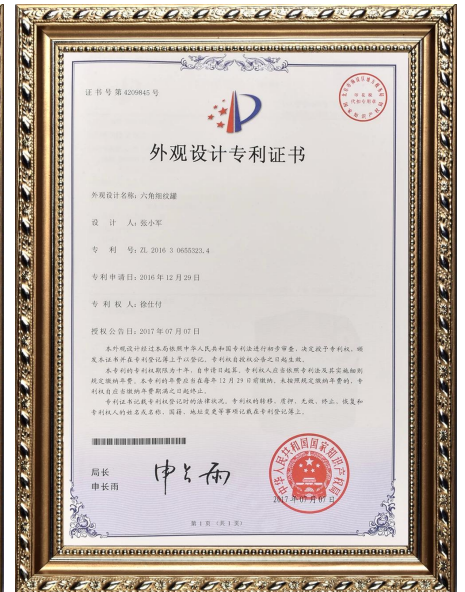
Patent Number: 201630655323.4