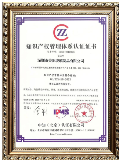
Geistiges Eigentum von Unternehmen