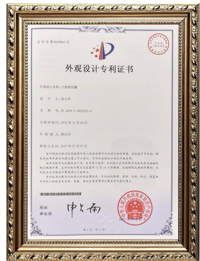
Patent Number: 201630655323.4