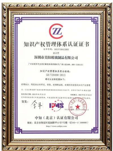
Geistiges Eigentum des Unternehmens