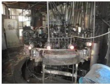
❑ Machine Blown