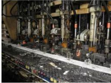
❑ IS Machine