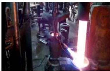
❑ Machin Pressed