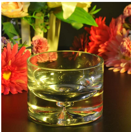
candle holder glass water drop