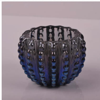
glass stripe dot candle holders