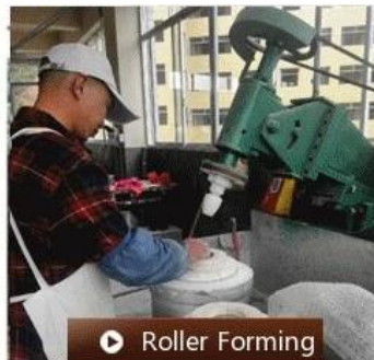
▶ Roller Forming