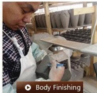
▶ Body Finishing