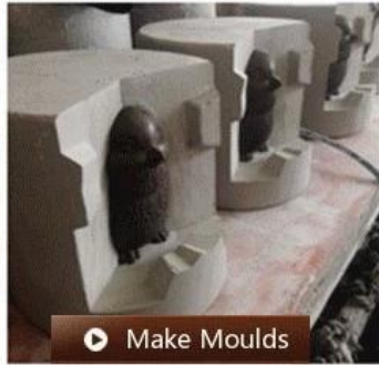
▶ Make Moulds