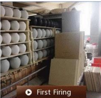
▶ First Firing