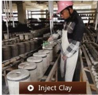
▶ Inject Clay