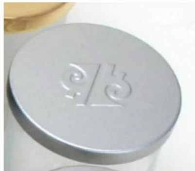
embossed logo on the lids