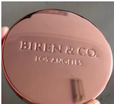
intagliated logo on the lids