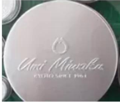
embossed logo on the lids