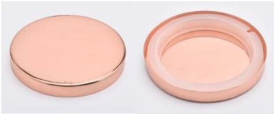
Rose gold color