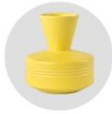
Solid color glaze