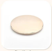
Zinc Alloy Cover