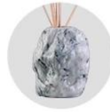
Water Transfer Printing