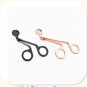
Wick Trimmer Cutter