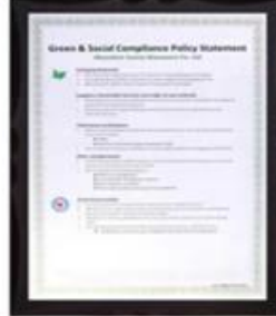
Green & Social Compliance