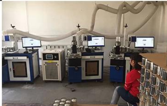
02 LASER ENGRAVING