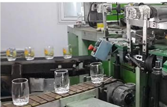
05 SCREEN PRINTING