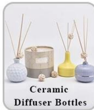
Ceramic Diffuser Bottles