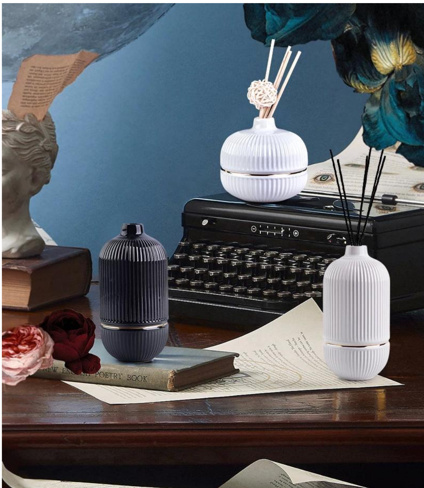
Figure 10. A still life composition featuring a vintage typewriter, a bust, books, and decorative vases with reed diffusers on a wooden desk.