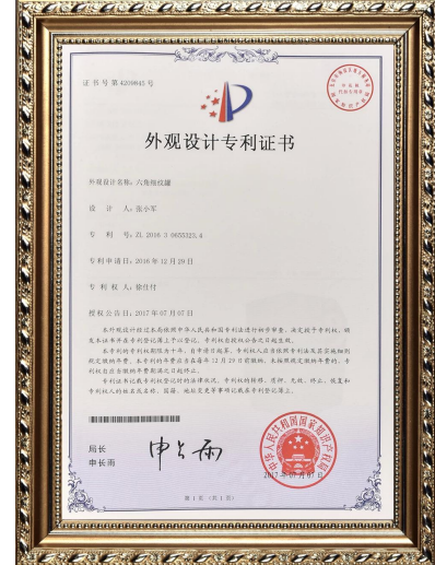
رقم براءة الاختراع: 201630655323.4