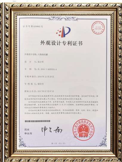
براءة الاختراع رقم: 20163065323.4