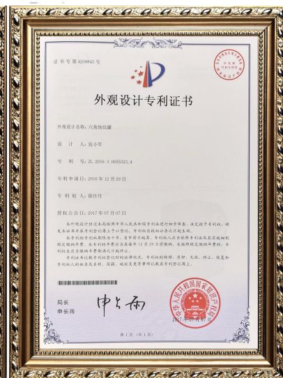
براءة الاختراع رقم: 20163065323.4