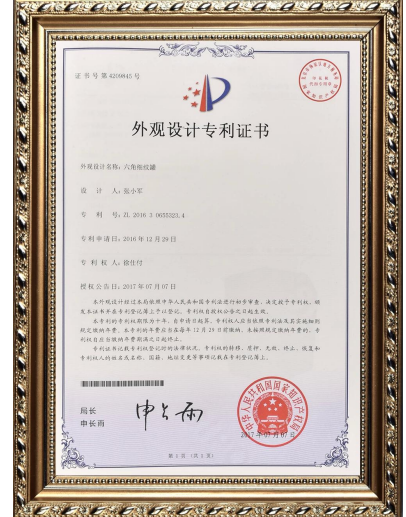
رقم براءة الاختراع: 201630655323.4