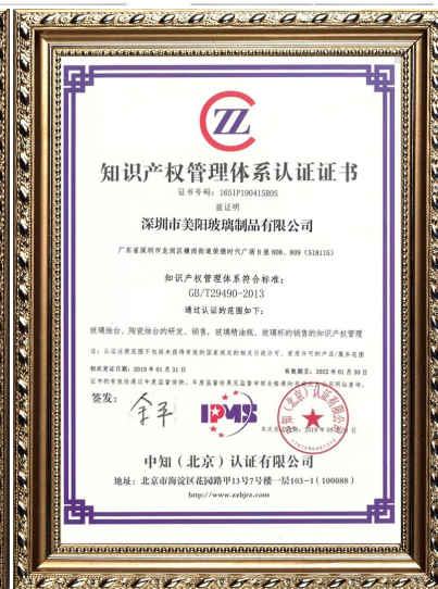
الملكية الفكرية للشركات