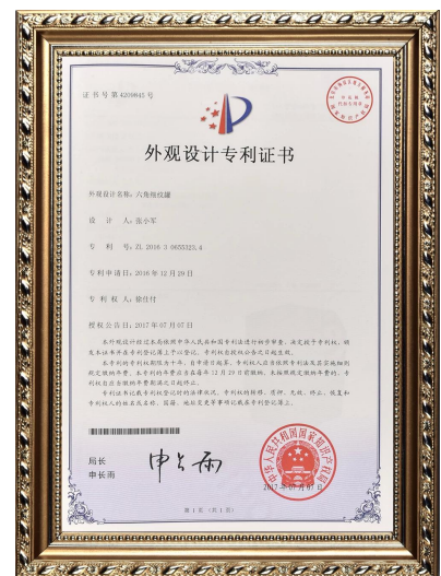
Patent no.: 201630655323.4