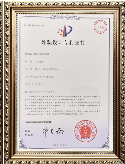
رقم براءة الاختراع: 201630655323.4