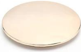
Zinc Alloy Cover