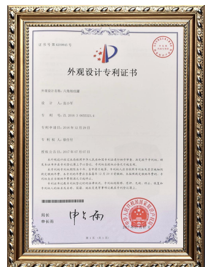
رقم براءة الاختراع: 201630655323.4