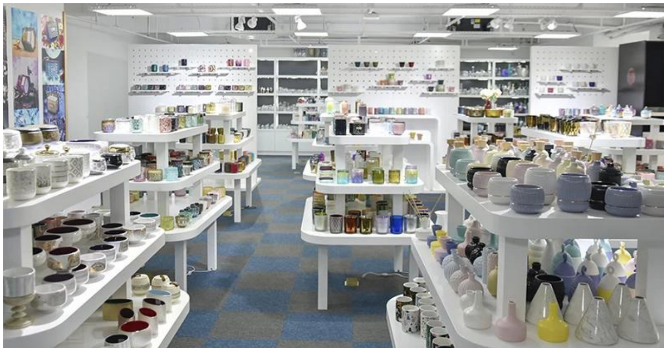
طرد و ينقل