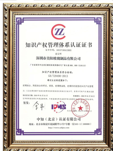
الملكية الفكرية للشركة