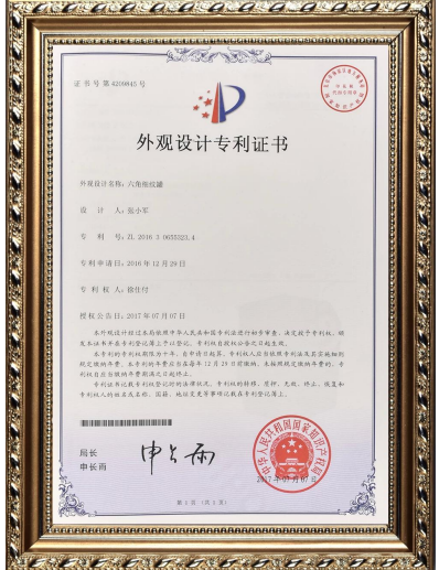
رقم براءة الاختراع: 201630655323.4