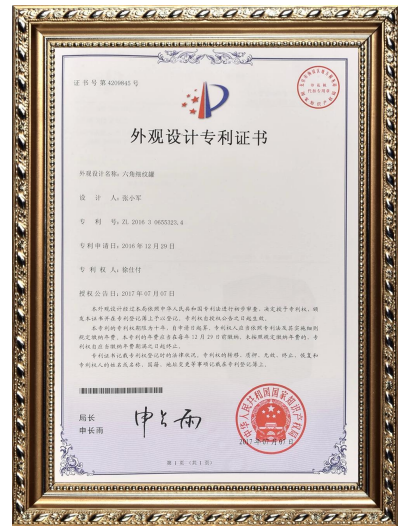
رقم براءة الاختراع: 201630655323.4