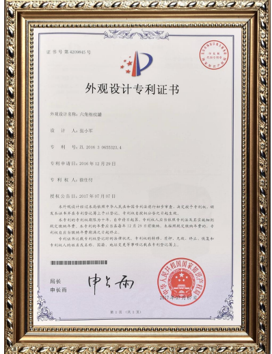
رقم براءة الاختراع: 20163065323.4