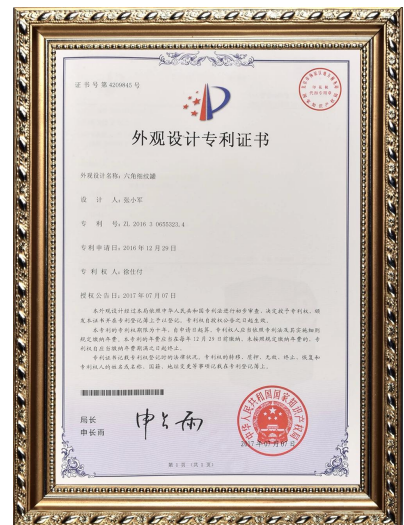
Patent Number: 20163065532.4