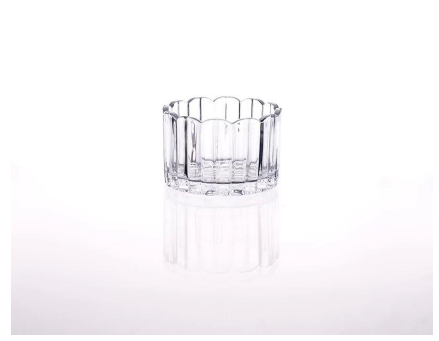
clear candlestick glass