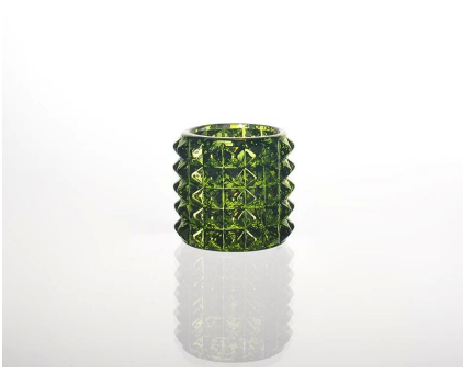
colored glass candle cup