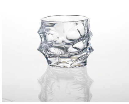
decoration glass candle holder