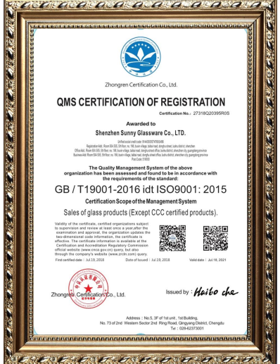
ISO 9001: 2015