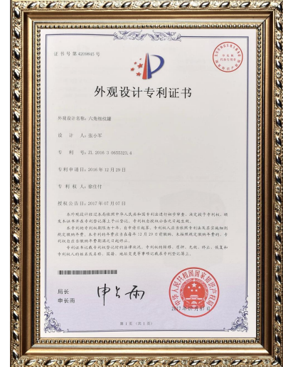
رقم براءة الاختراع: 20163065532.4