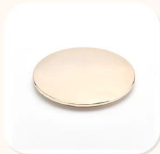
Zinc Alloy Cover