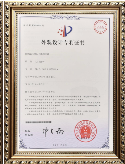
براءة الاختراع رقم: 20163065323.4