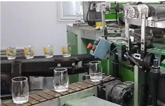
05 SCREEN PRINTING