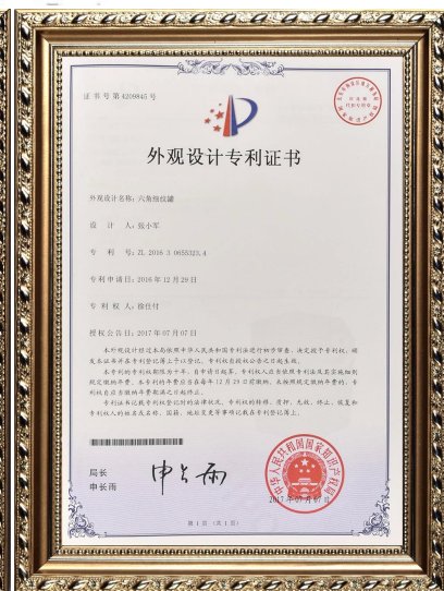
براءة الاختراع رقم: 20163065323.4