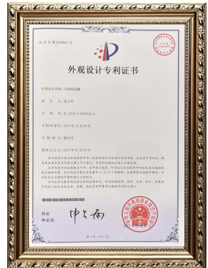
رقم براءة الاختراع: 201630655323.4