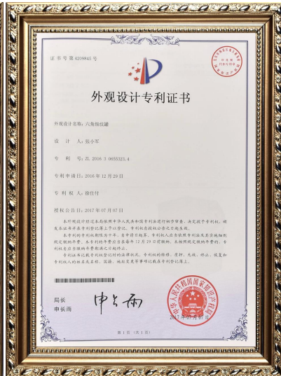
رقم براءة الاختراع: 201630655323.4