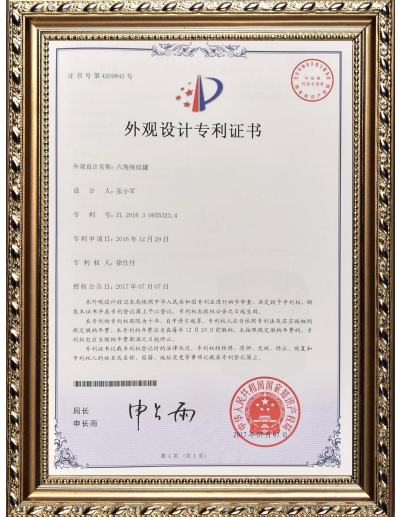
رقم براءة الاختراع: 201630655323.4