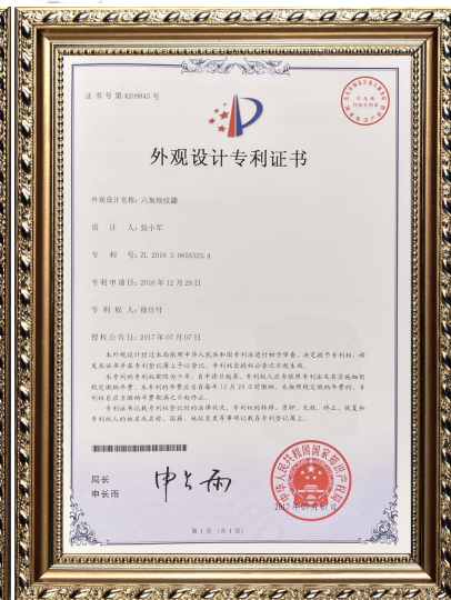
رقم براءة الاختراع: 201630655323.4