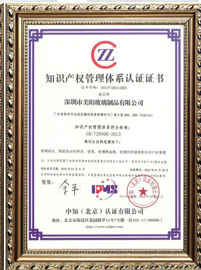
الملكية الفكرية للشركات