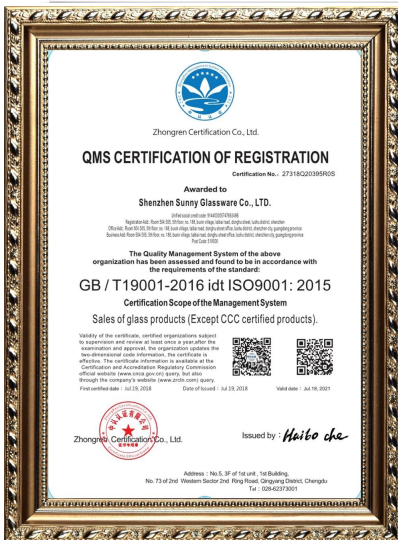
ISO 9001: 2015