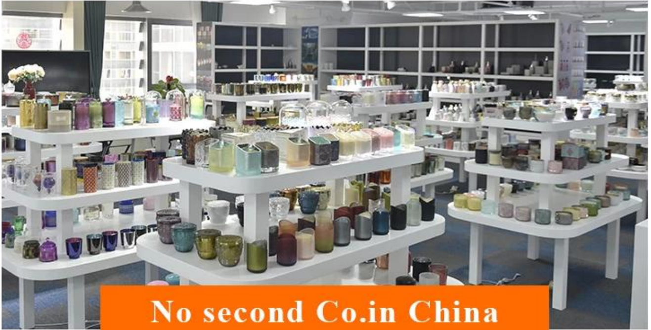
No second Co.in China Such a large and abundant sample room

370 00000000 000000 00000000 000000 0000 0000 0000000000 0000 00 00000000