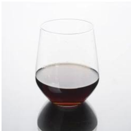
clear whisky glass cup