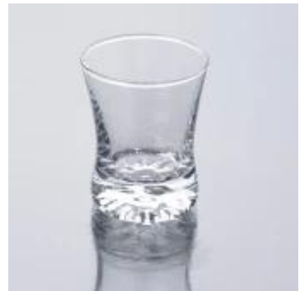
unique design whisky glass cup