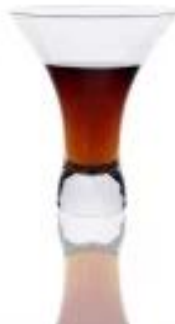
clear whisky glass tumbler