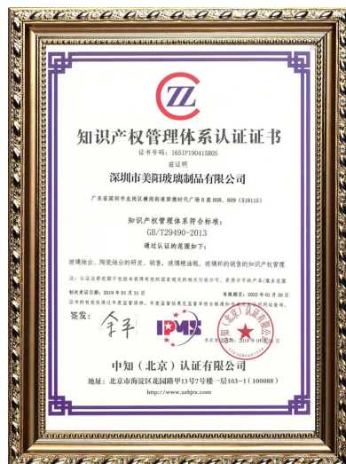
الملكية الفكرية للمؤسسة