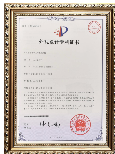
Patent no.: 201630655323.4