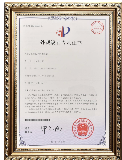
براءة اختراع رقم: 201630655323.4