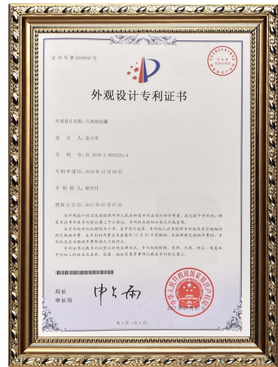
رقم براءة الاختراع: 20163065532.4