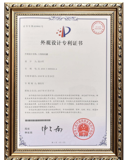
رقم براءة الاختراع: 20163065323.4