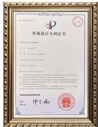
Номер патента: 20163065523.4.