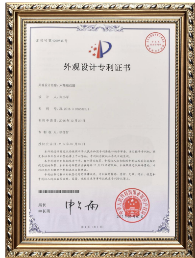
Патентный номер: 20163065523.4