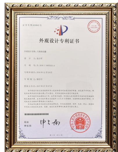
Номер патента: 201630655323.4.