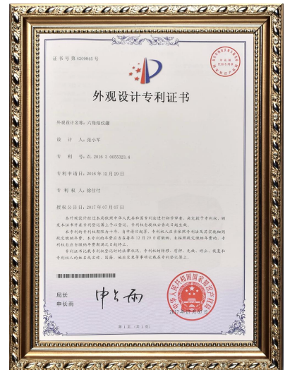
Número da patente: 201630655323.4