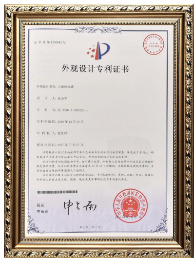
Patente no.: 201630655323.4