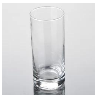
9.5 OZ highball glass