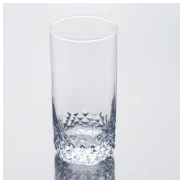
Heat-resistant glass water tumbler