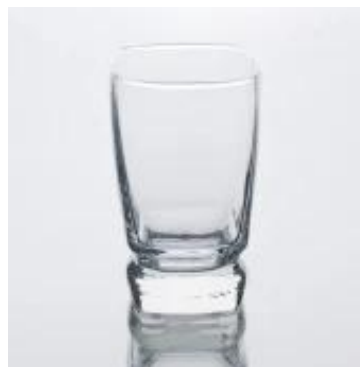
Latest design glass cup